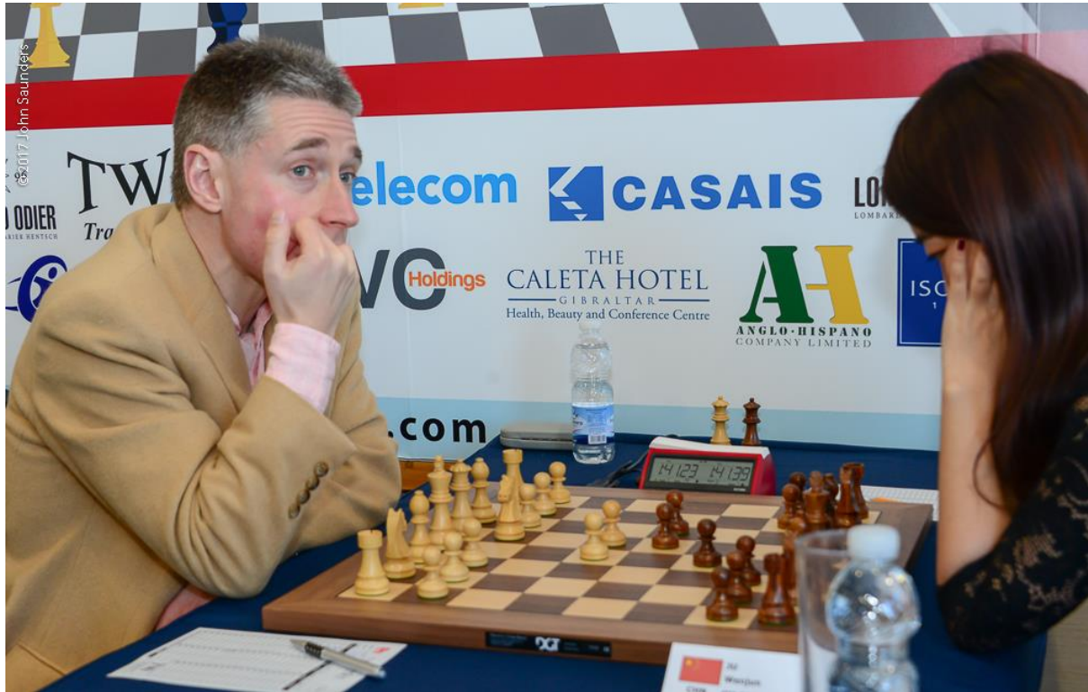
Mickey Adams looks relaxed (bored?) against Ju Wenjun

Wenjun's e-pawn in an earlier report. In fact, Mickey did do this but only after the e-pawn had captured and become a d5-pawn. I'm not sure whether that counts. Anyway, Mickey was already well on course for victory by the time this occurred and he later expressed relief that he finally managed a shorter game than his previous marathon encounters. Ju Wenjun's 10...b5 move looked risky and once Mickey had established his a-pawn on the sixth rank her position was very uncomfortable.