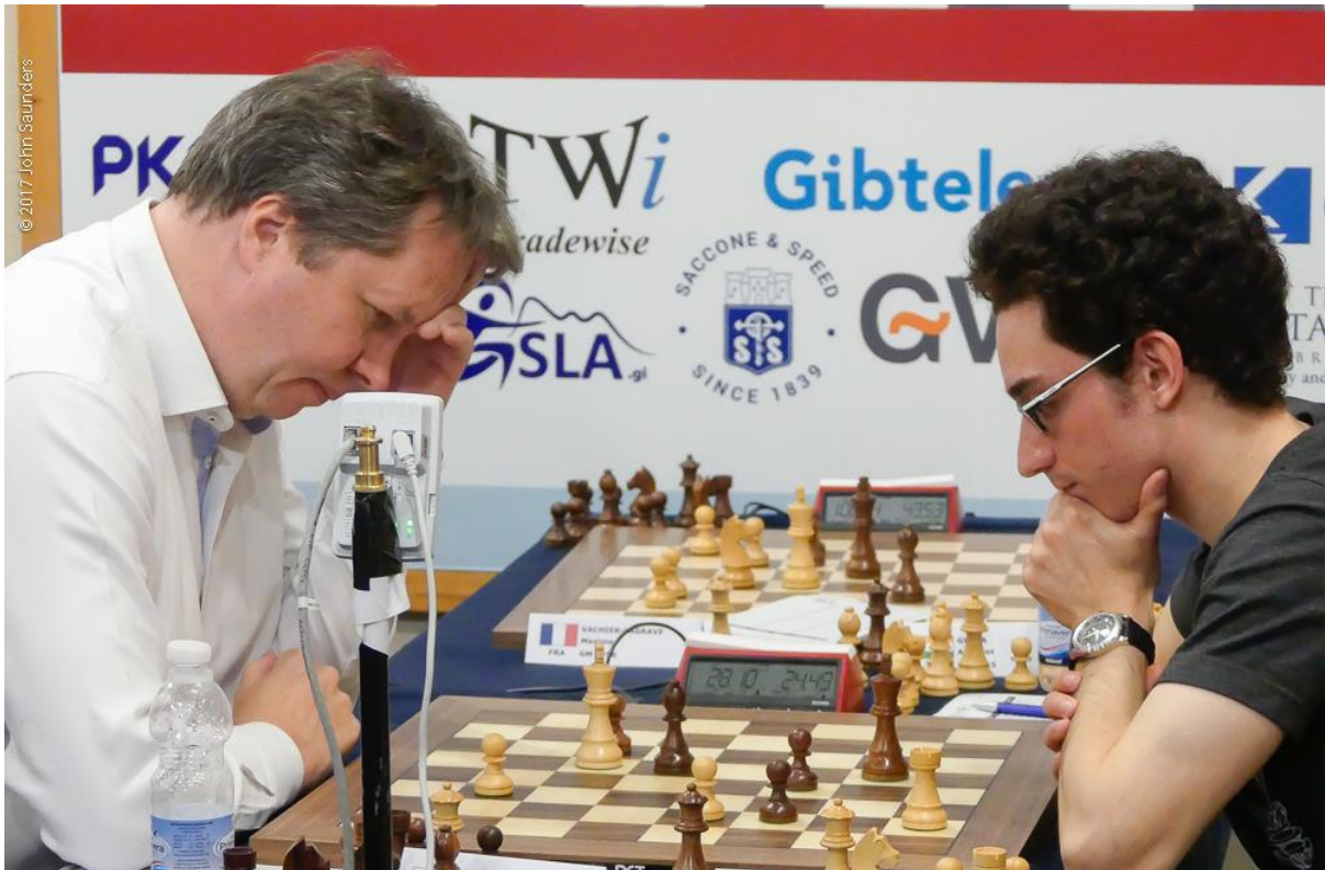
Nigel Short close to victory against Fabiano Caruana